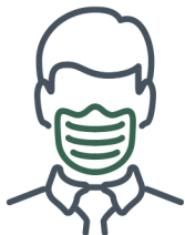
WEARING A MASK

Prevent the spread of infection by always doing the following: