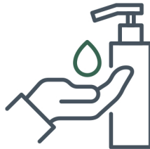
WASHING YOUR HANDS REGULARLY